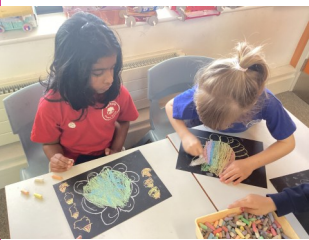
Beech class went to India and drew rangoli patterns.