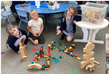
Chestnut class went to Spain. All aboard!